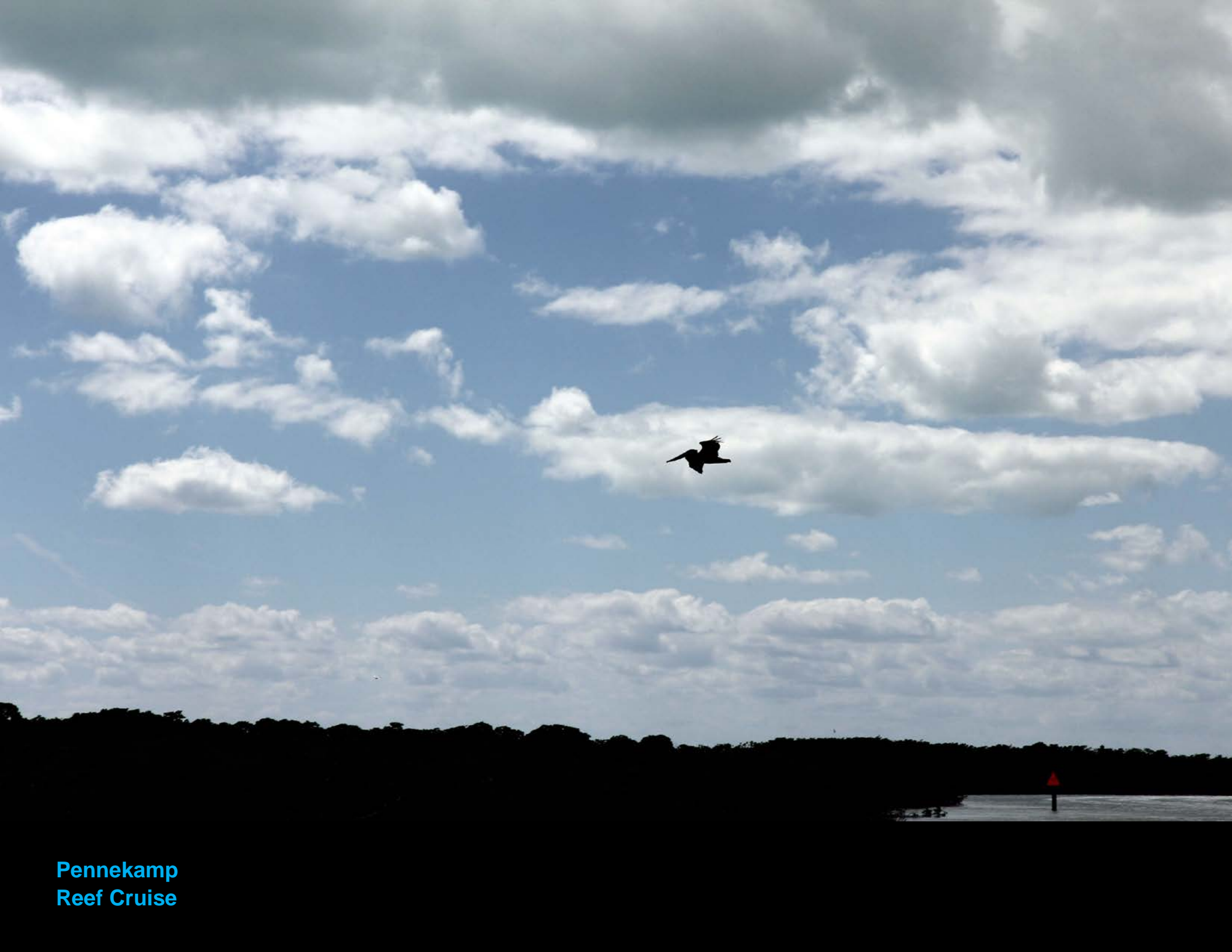
Pennekamp Reef Cruise