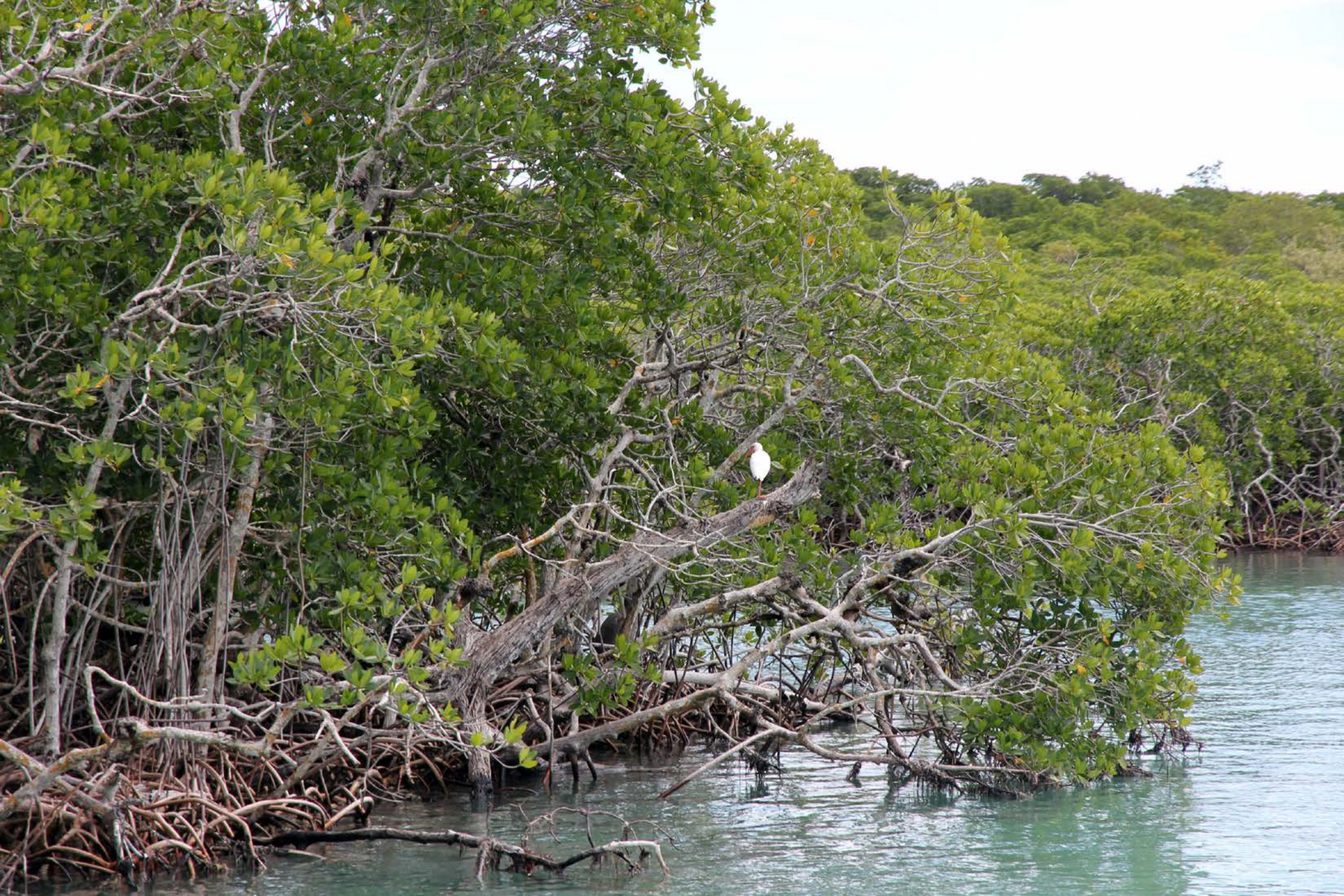
Pennekamp Reef Cruise