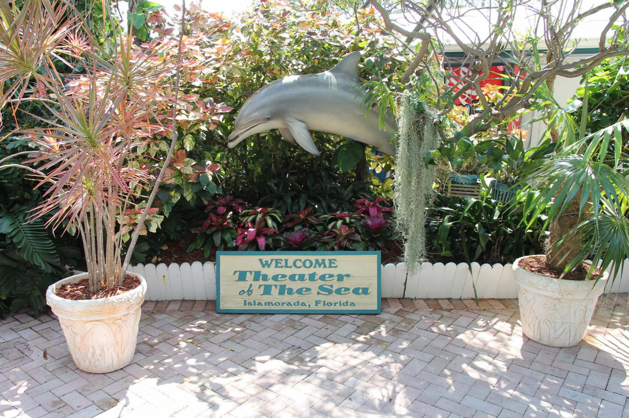
Theater of The Sea

Theater of The Sea in Islamorada, 18 miles south of the hotel, is one of the oldest marine mammal facilities in the world.