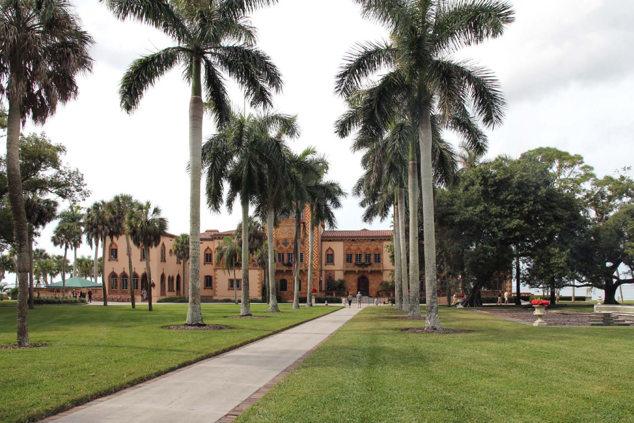
Ringling Mansion Ca' d'Zan

John and Mabel Ringling built their palatial 56-room mansion on Sarasota Bay between 1924 and 1926.