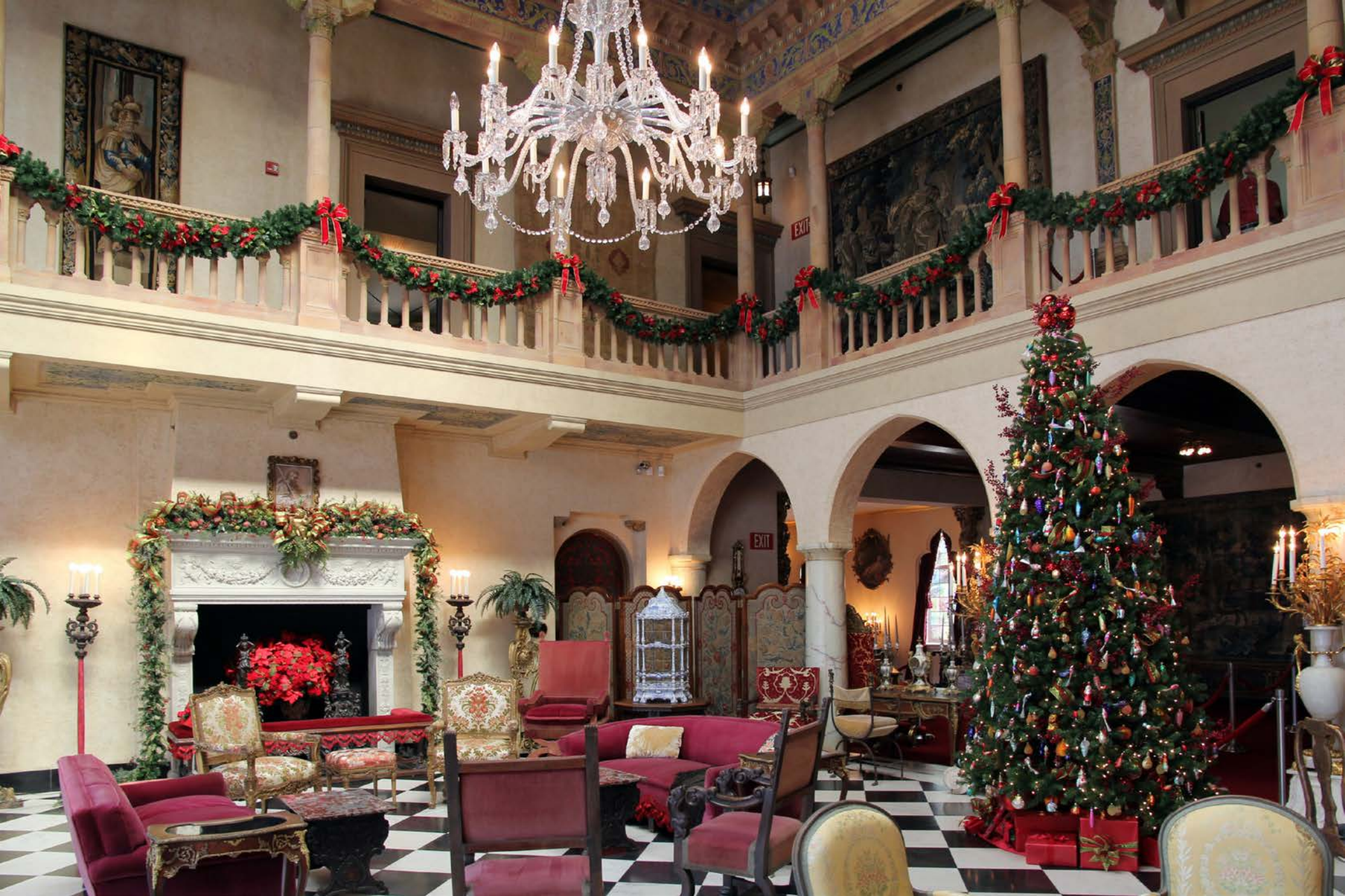
Ringling Mansion Ca' d'Zan

A six-year $15 million restoration completed in 2002 returned the mansion to its original glory.