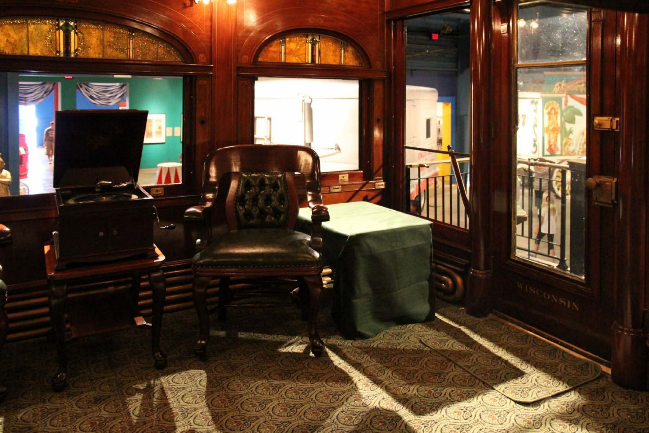
Ringling Circus Museum

Interior of the Observation Room of The Wisconsin . The car also contains three bedrooms, a dining room, kitchen, bathroom, and servants' quarters.