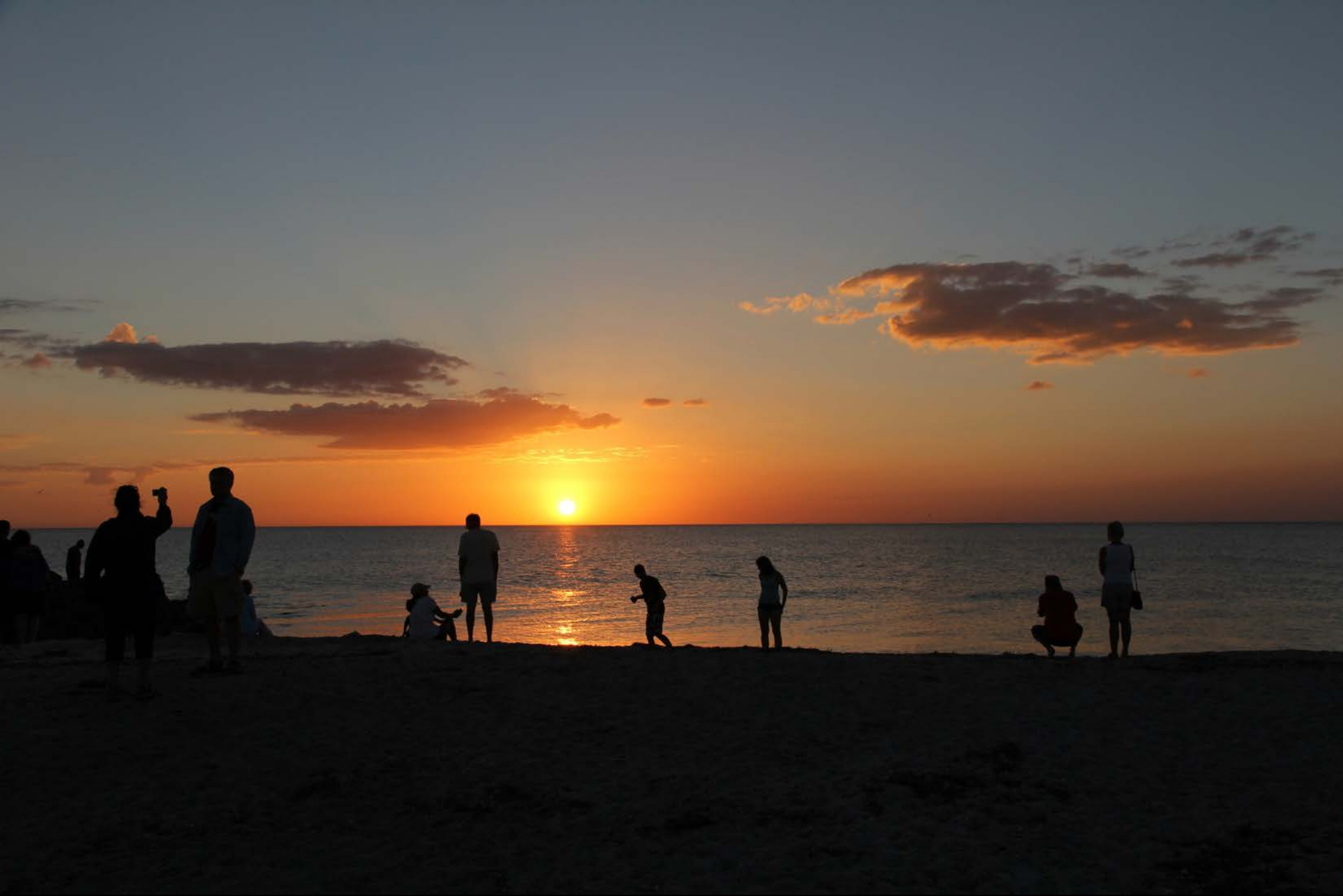
Sanibel Island Sunset