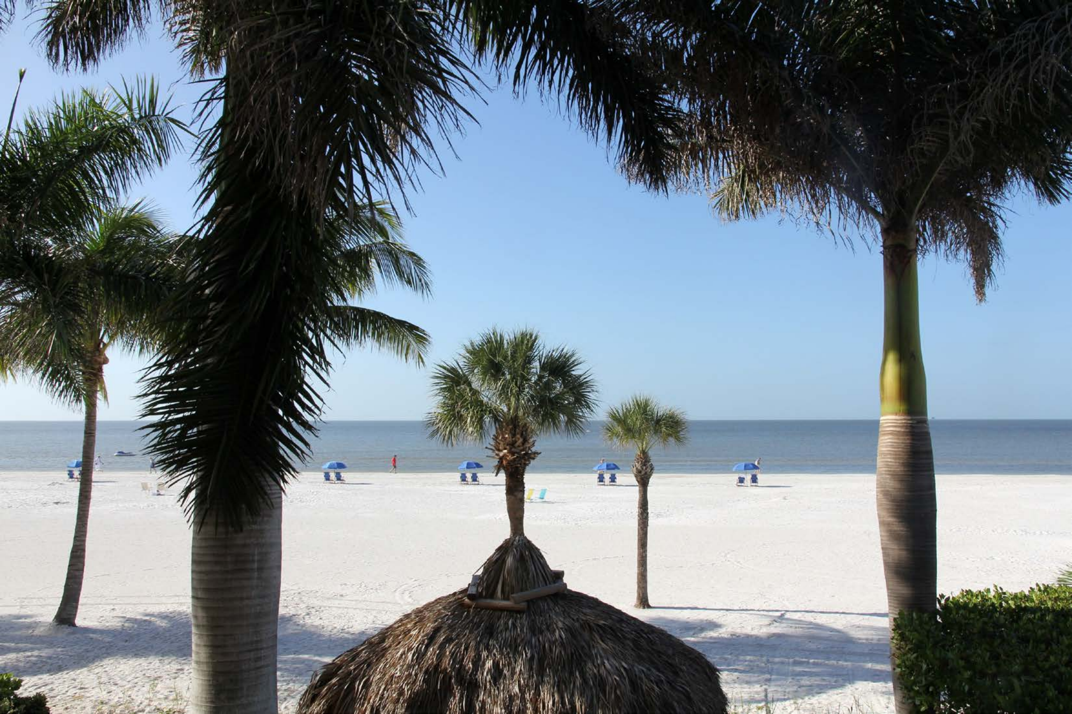
Fort Myers Beach