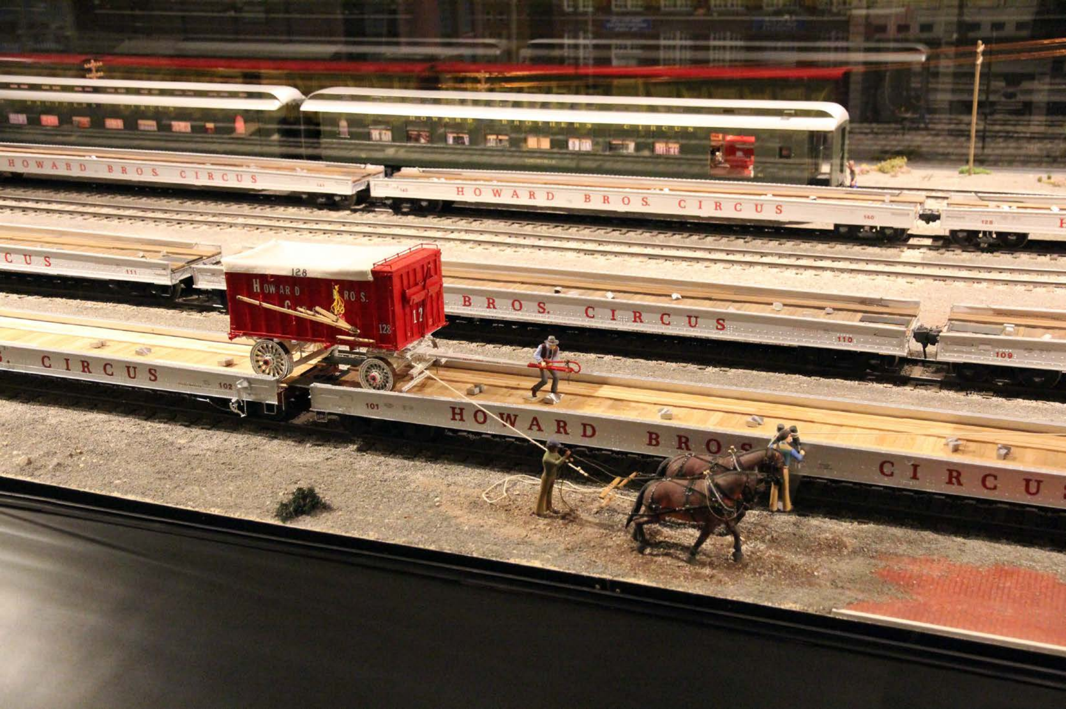
Ringling Circus Museum

Techniques were developed for loading circus wagons onto railway flatcars for quick trips between towns.