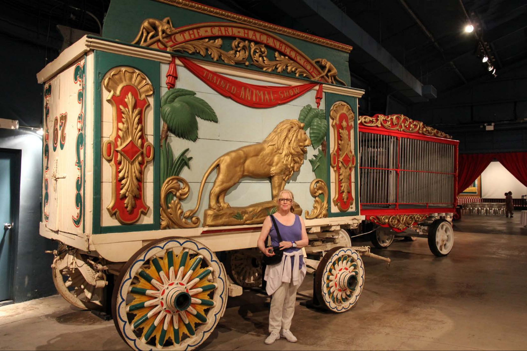
Ringling Circus Museum

And it houses some of the colourful parade wagons which gave the circus its unique identity.