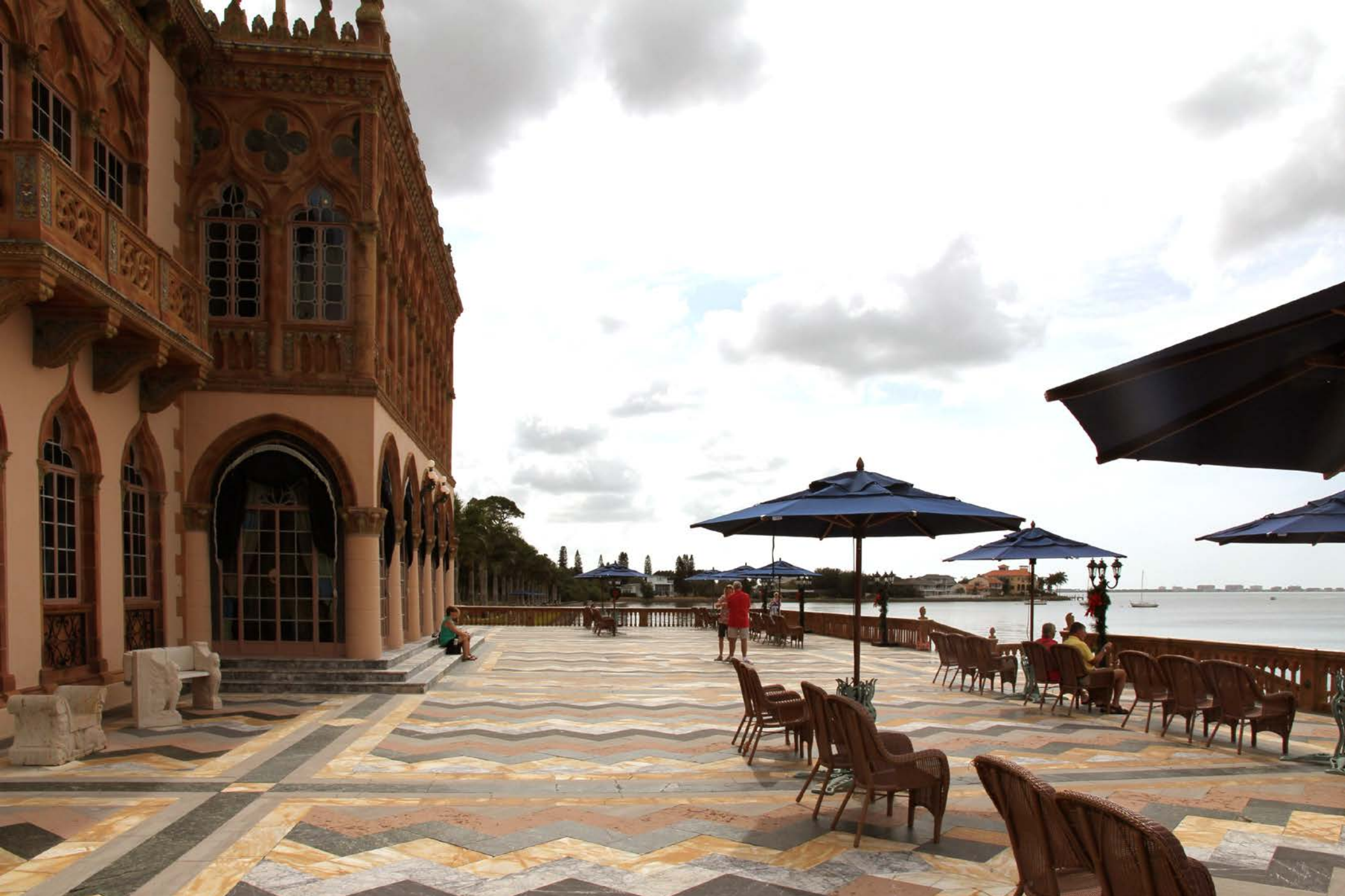
Ringling Mansion Ca' d'Zan

... with Sarasota Bay serving as the Grand Canal. Ca' d'Zan means "House of John" in Venetian dialect.