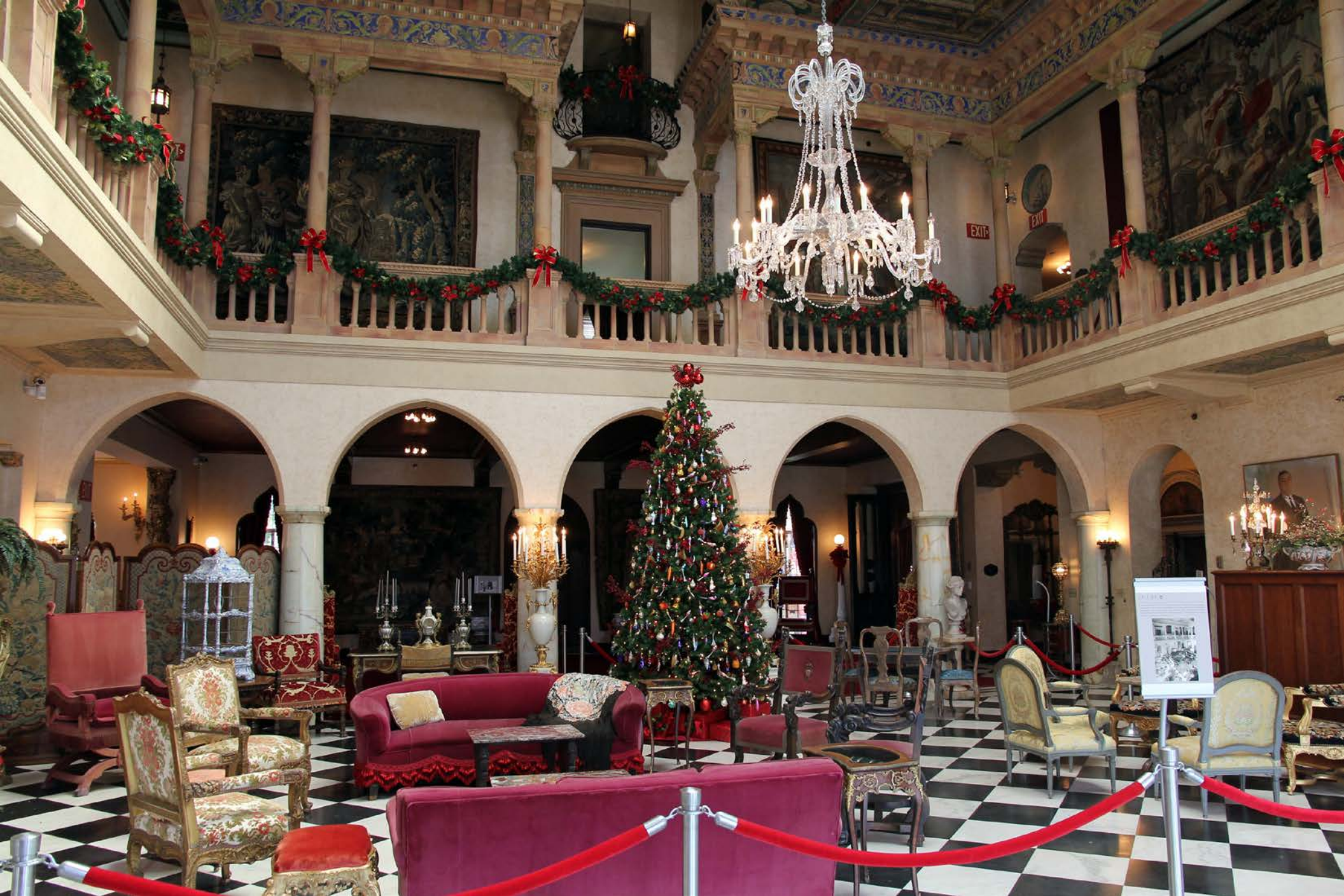
Ringling Mansion Ca' d'Zan

The living room was designed and furnished for entertaining on a grand scale, and hosted political and entertainment industry celebrities.