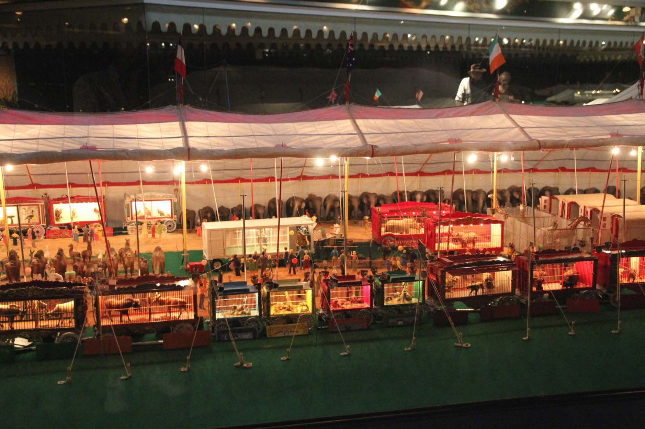
Ringling Circus Museum