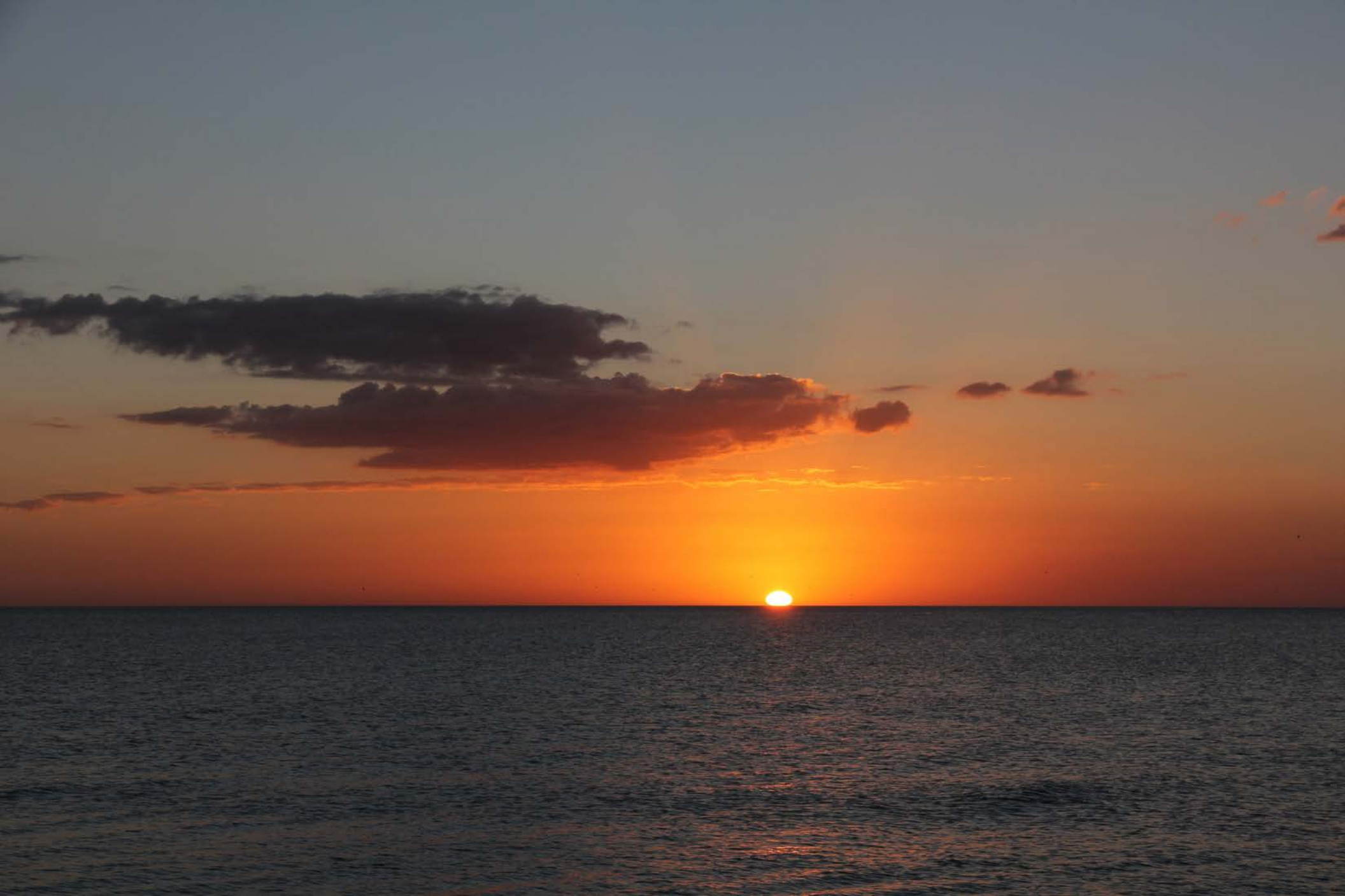
Sanibel Island Sunset