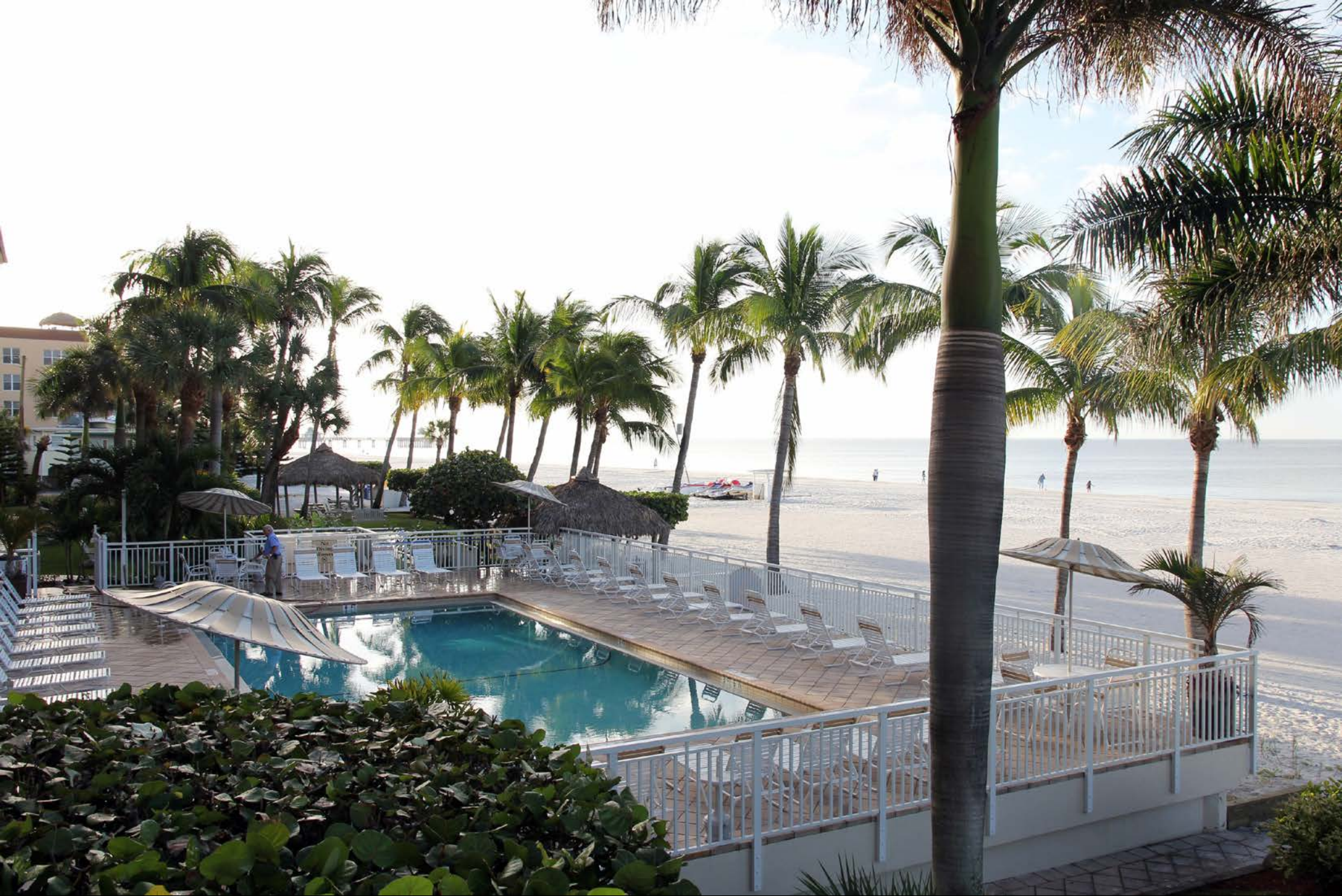
Fort Myers Beach