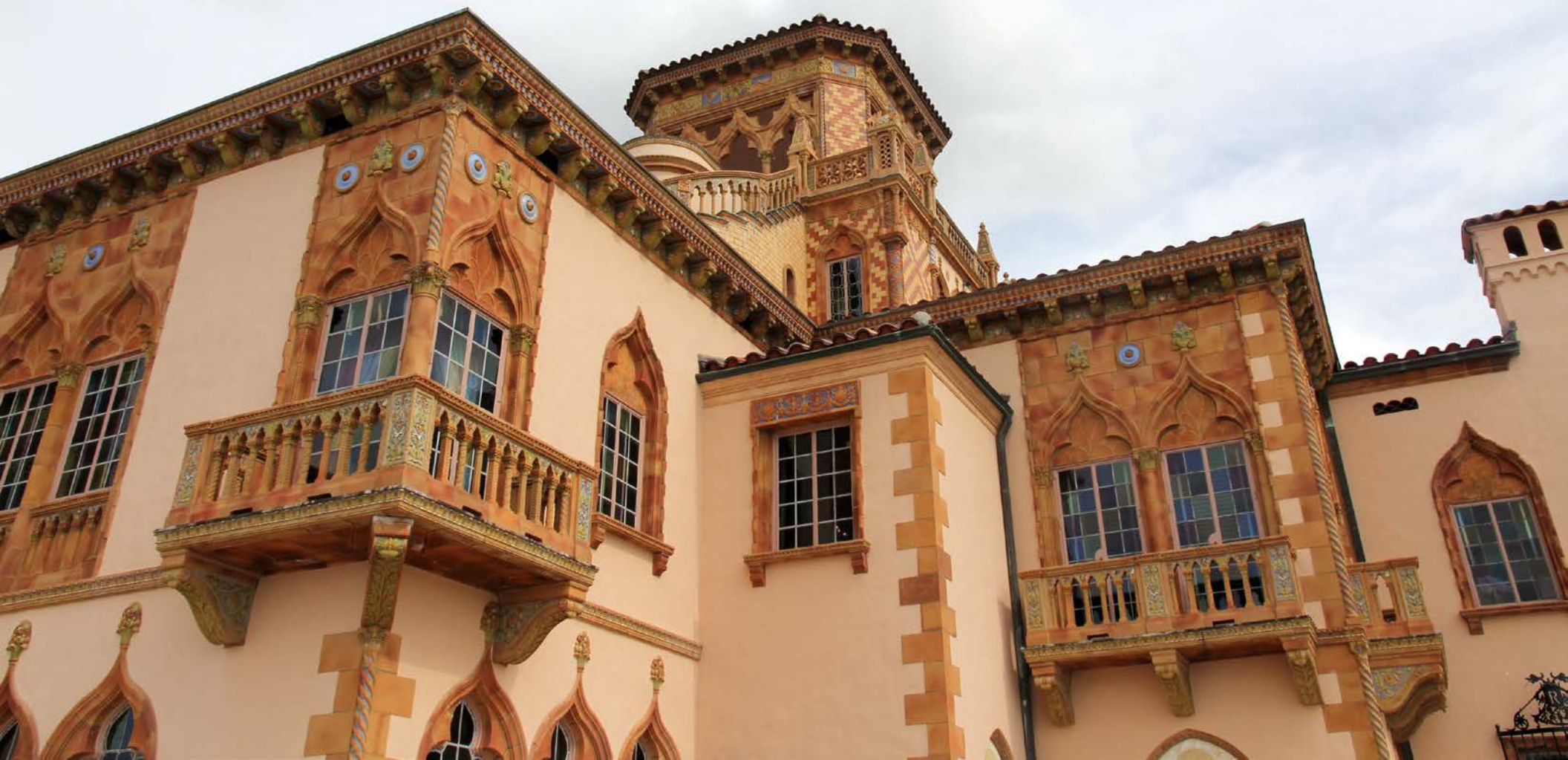
Ringling Mansion Ca' d'Zan

The pinnacle of the structure is the 81-foot / 25 m Belvedere tower, with an open-air overlook and a high domed ceiling.