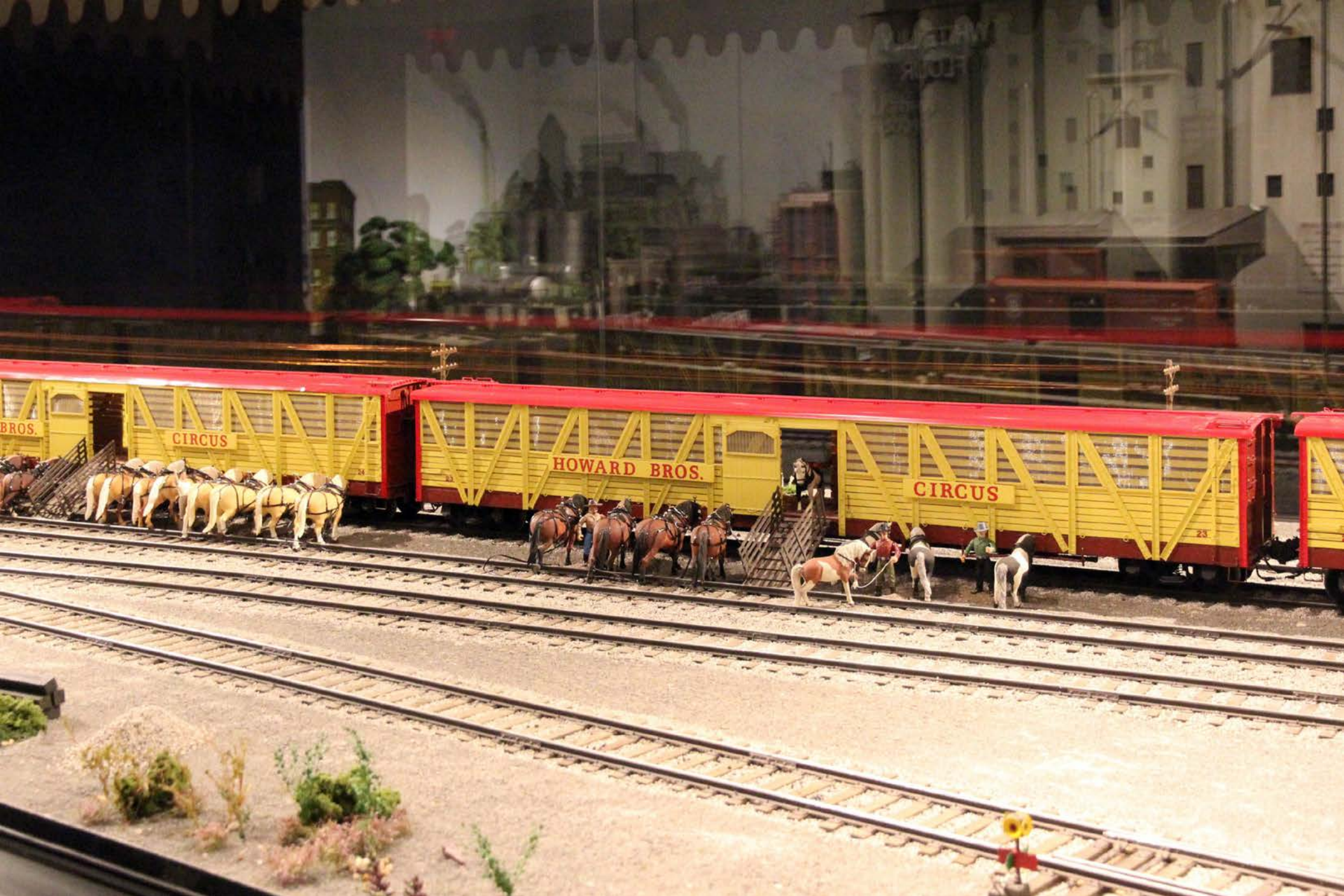
Ringling Circus Museum

The railroad made it possible for the circus to travel efficiently all across America, bringing the circus to cities and towns, both large and small.