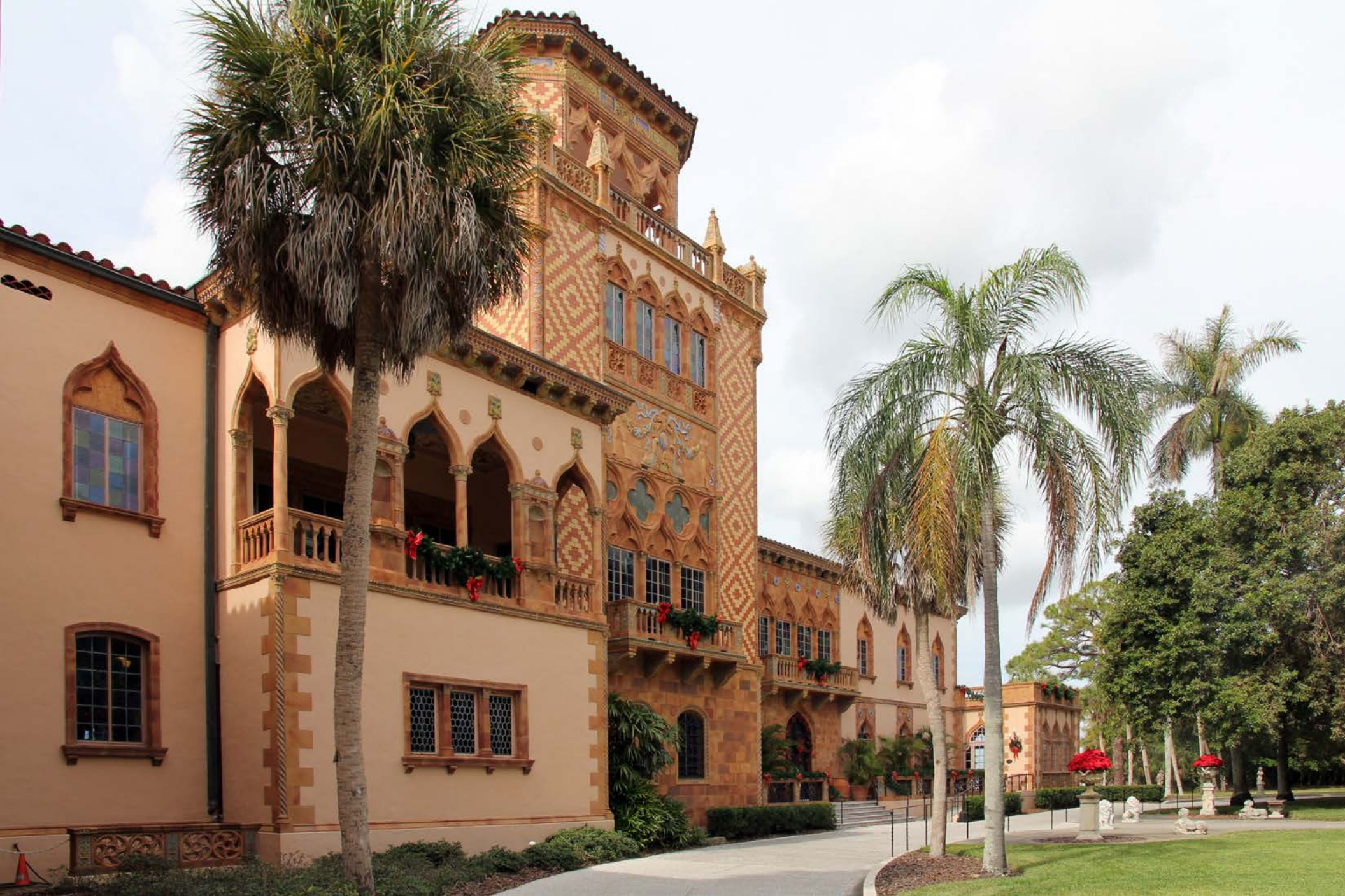
Ringling Mansion Ca' d'Zan

The Ringlings travelled extensively in Europe, searching out acts and ideas for their circus, and fell in love with Mediterranean architecture.