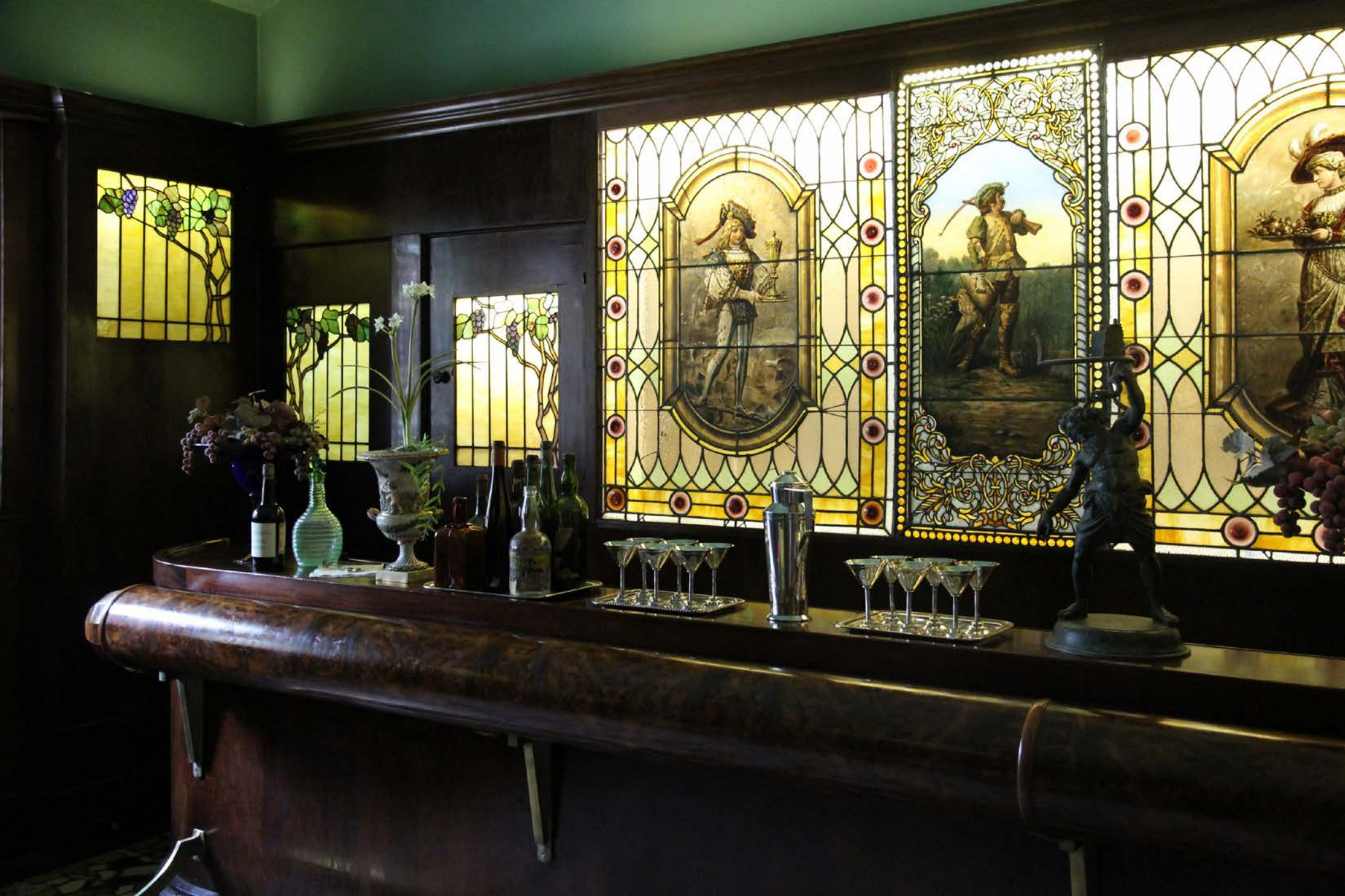
Ringling Mansion Ca' d'Zan