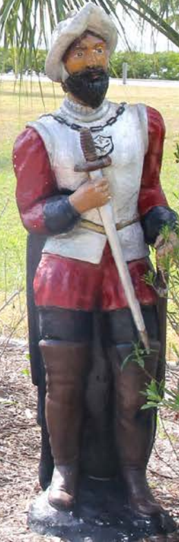
Ponce de Leon Park Punta Gorda

Juan Ponce de León was the first Spanish explorer to arrive in Florida, probably in 1460. This plaque commemorates his 1513 visit to the Punta Gorda area.