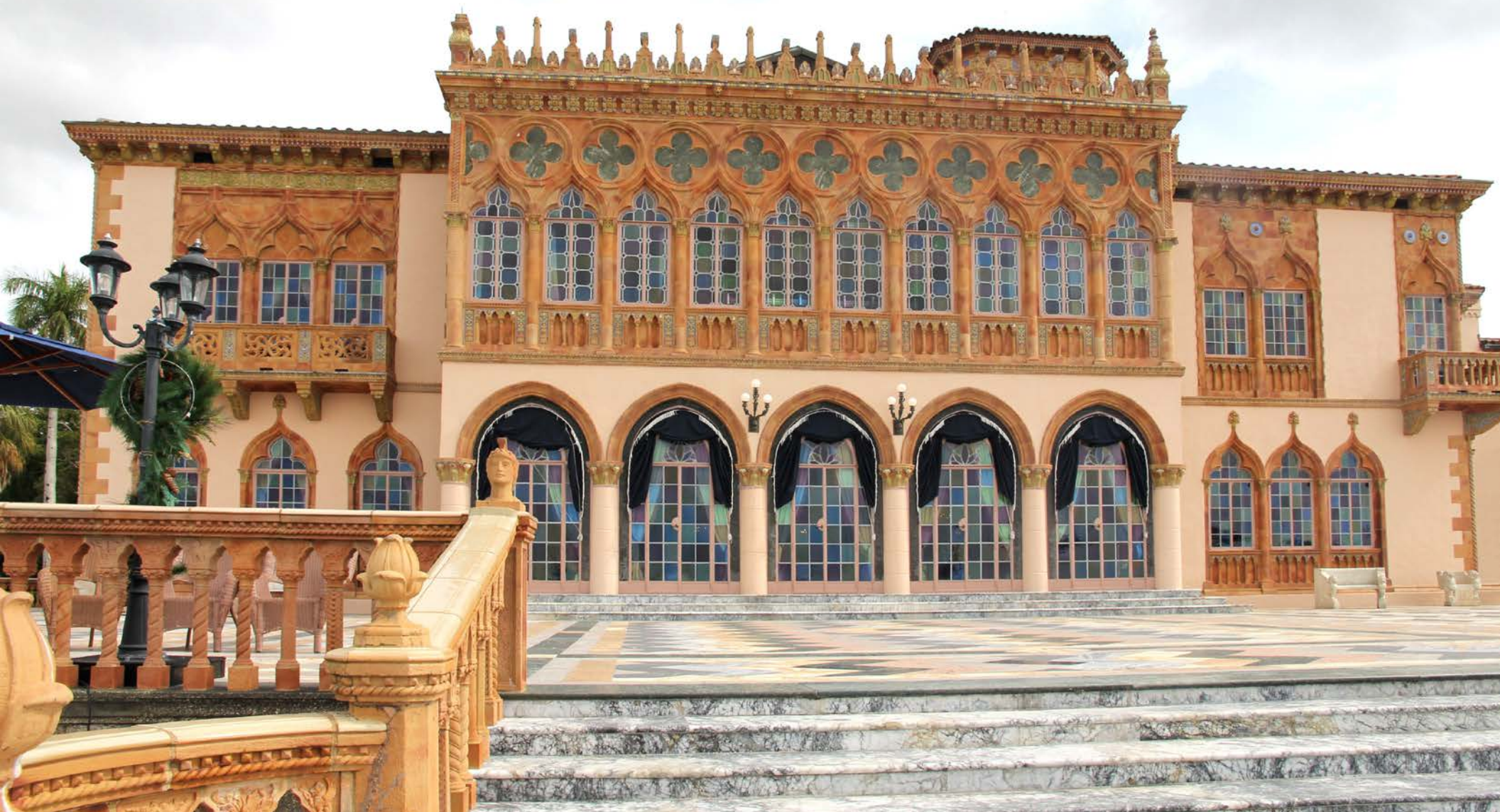
Ringling Mansion Ca' d'Zan