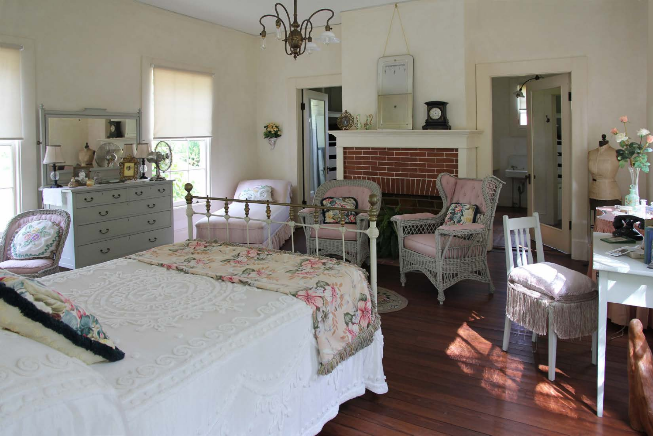
Edison & Ford Estates