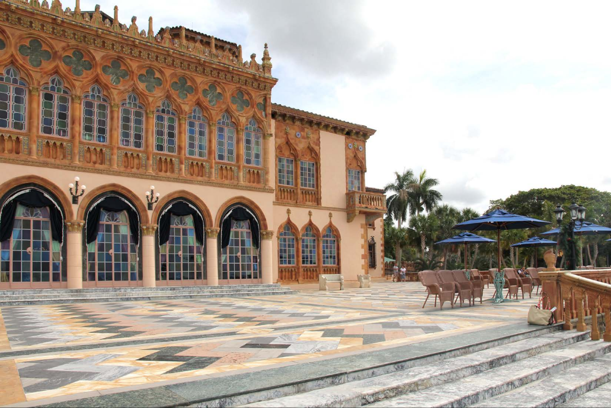
Ringling Mansion Ca' d'Zan

The bayfront terrace is made of domestic and imported marble.