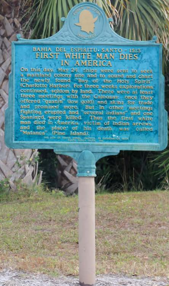
Ponce de Leon Park

His 1513 visit was marred by a conflict with the natives that left one of his men and several Indians dead. The first event in a long and tragic history.