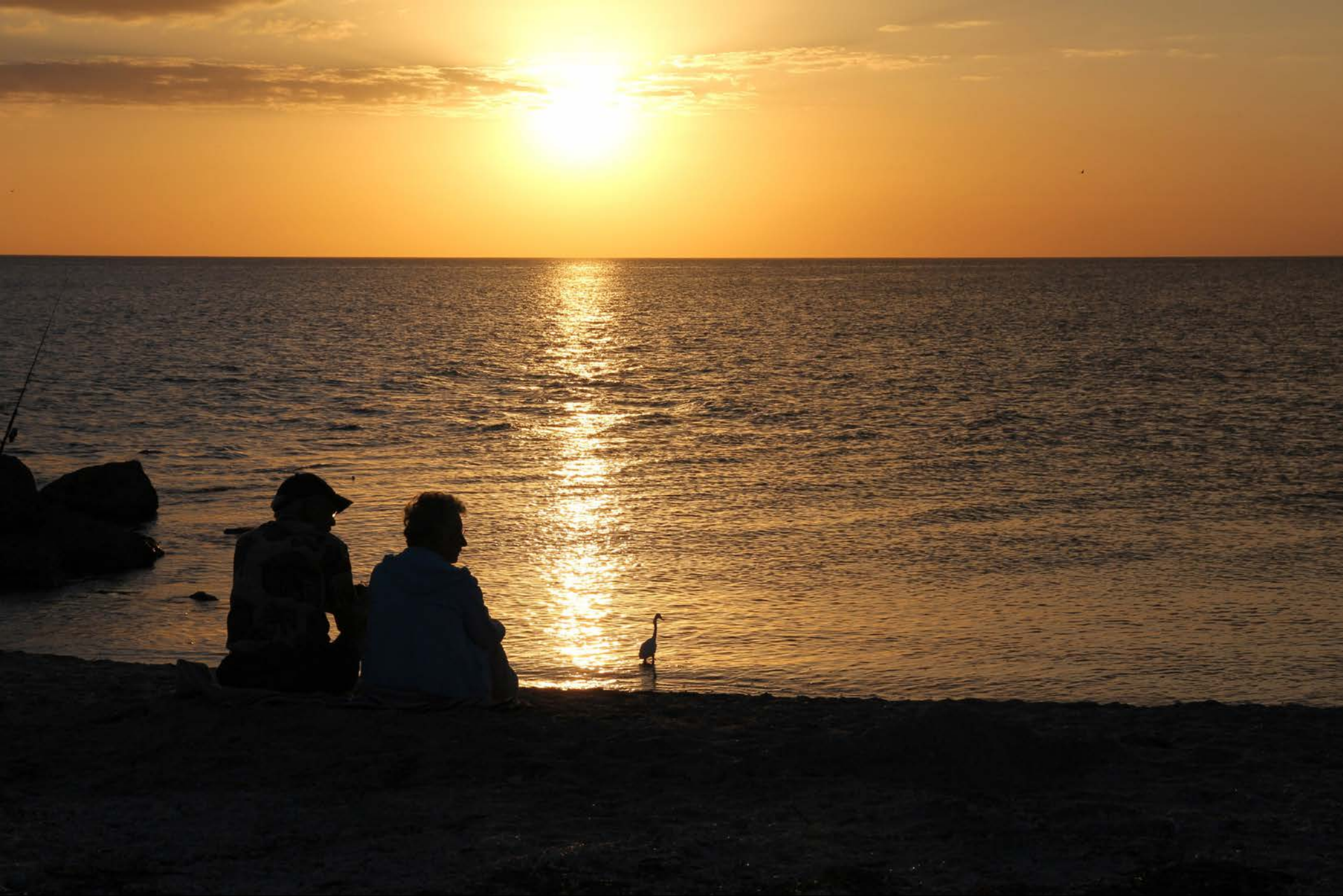
Sanibel Island Sunset