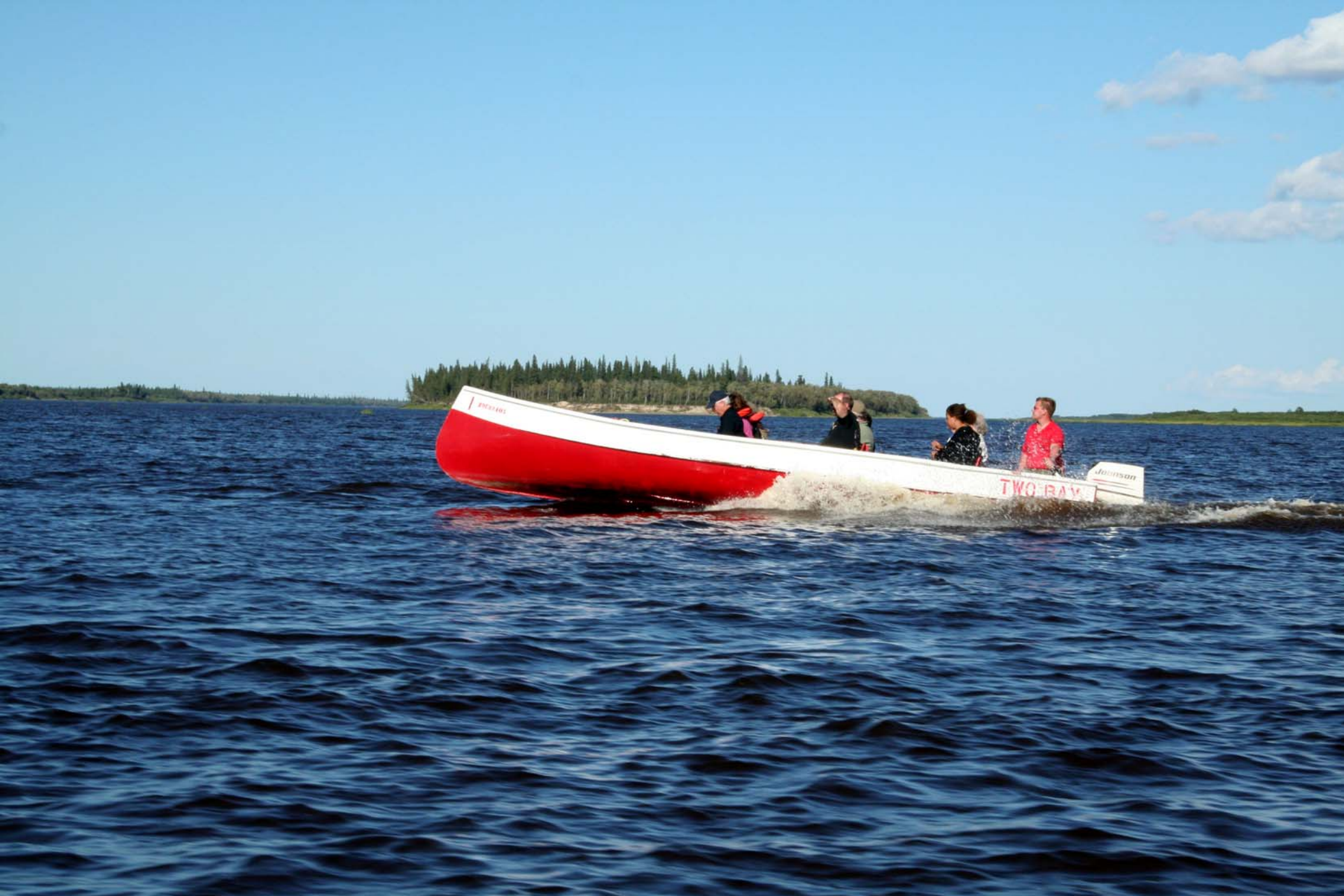
Fossil Island Moose River Moosonee