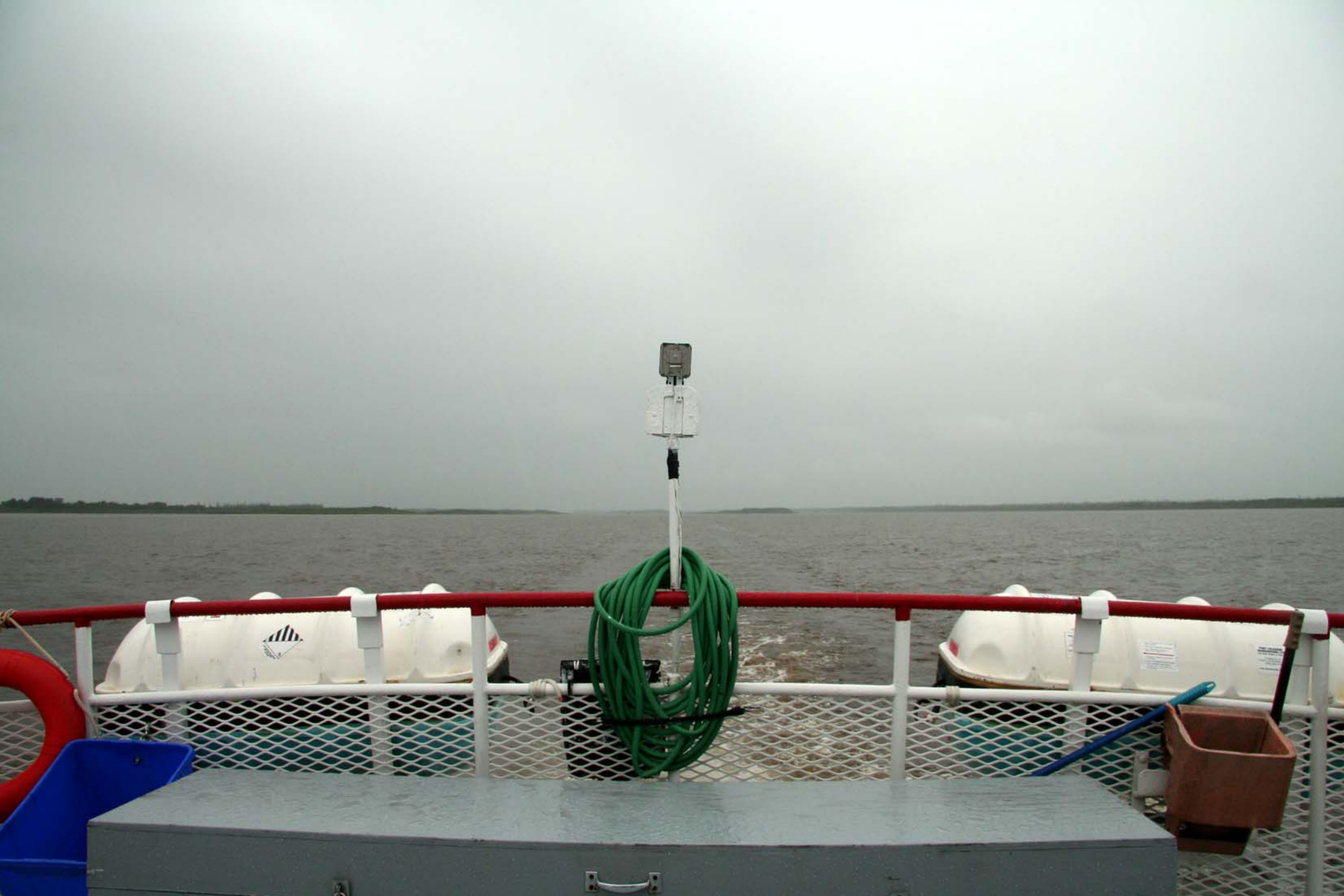
To James Bay The morning we set out it is cloudy and rainy. James Bay empties into Hudson Bay, and in turn into the Arctic Ocean