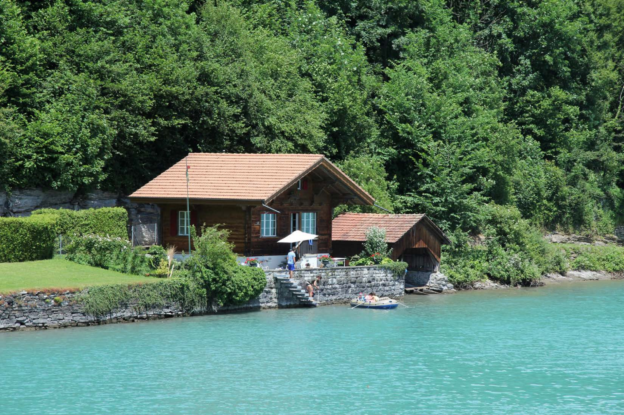
Lake Brienz A summer cottage near Ringgenberg