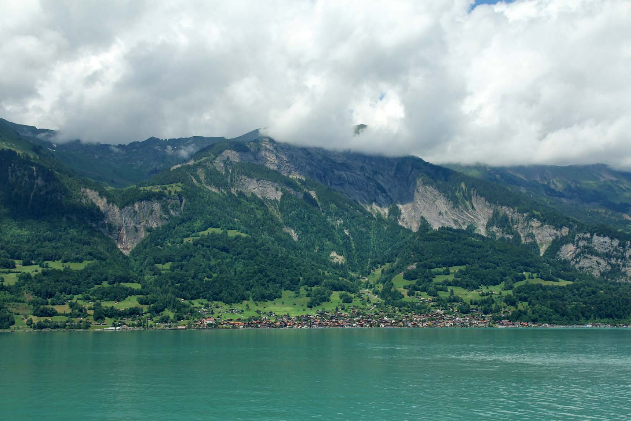
Lake Brienz Headed towards Brienz near the end of the lake.