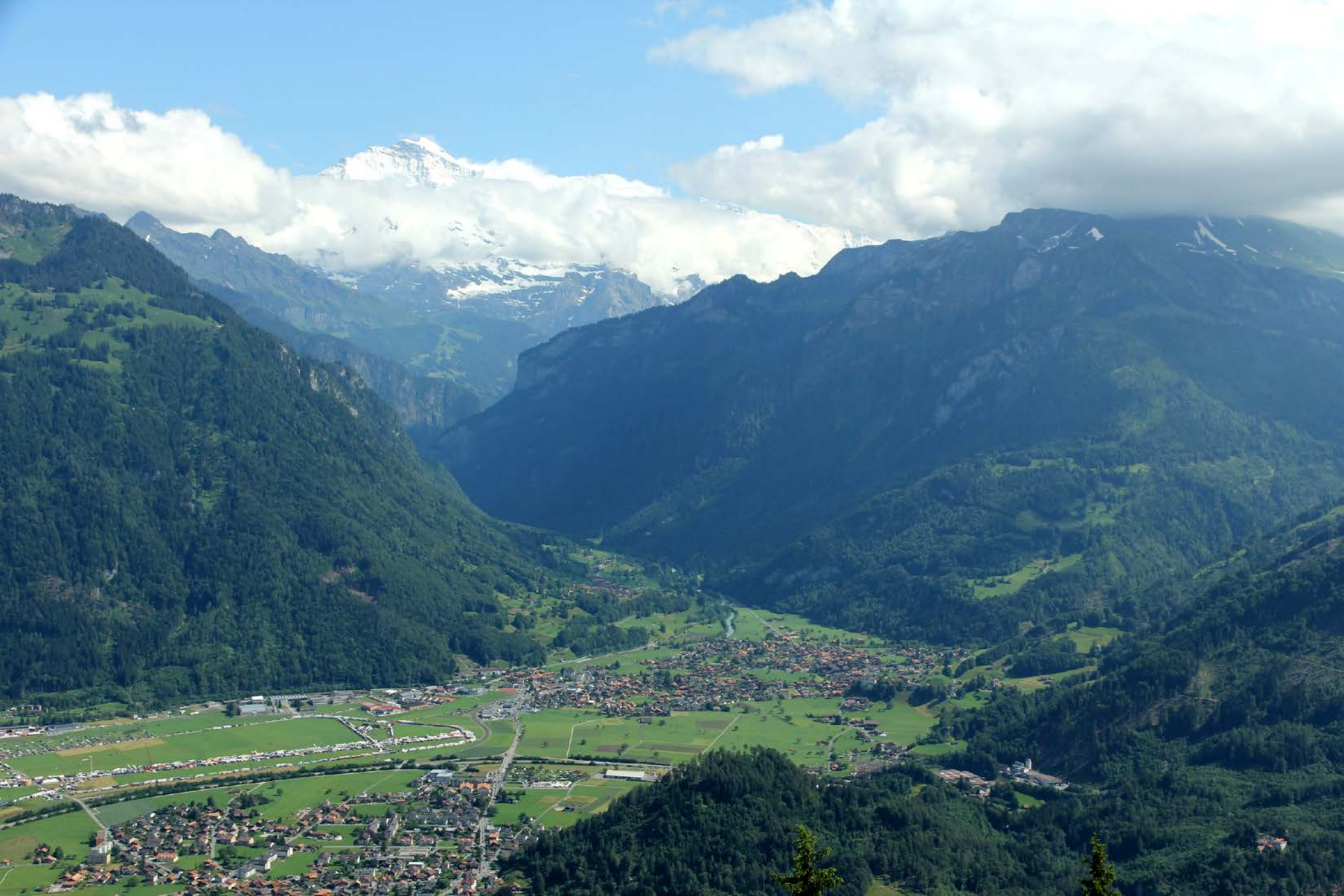
Harder Kulm ... and of the Lauterbrunnen Valley to the south ...