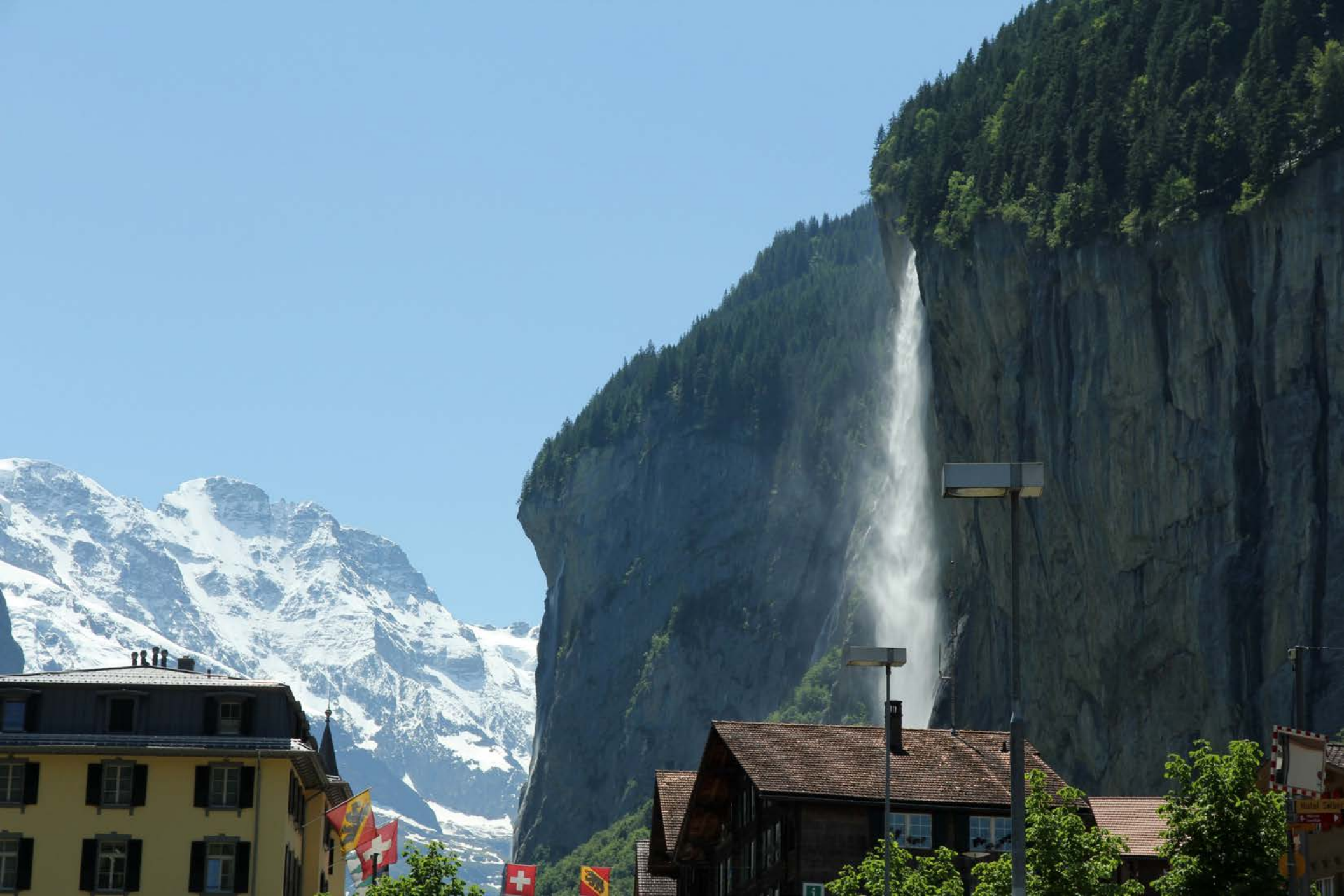
Lauterbrunnen Staubbach Falls drops 1,000 feet / 300 metres from a cliff just south of Lauterbrunnen, seemingly emptying right into the village.