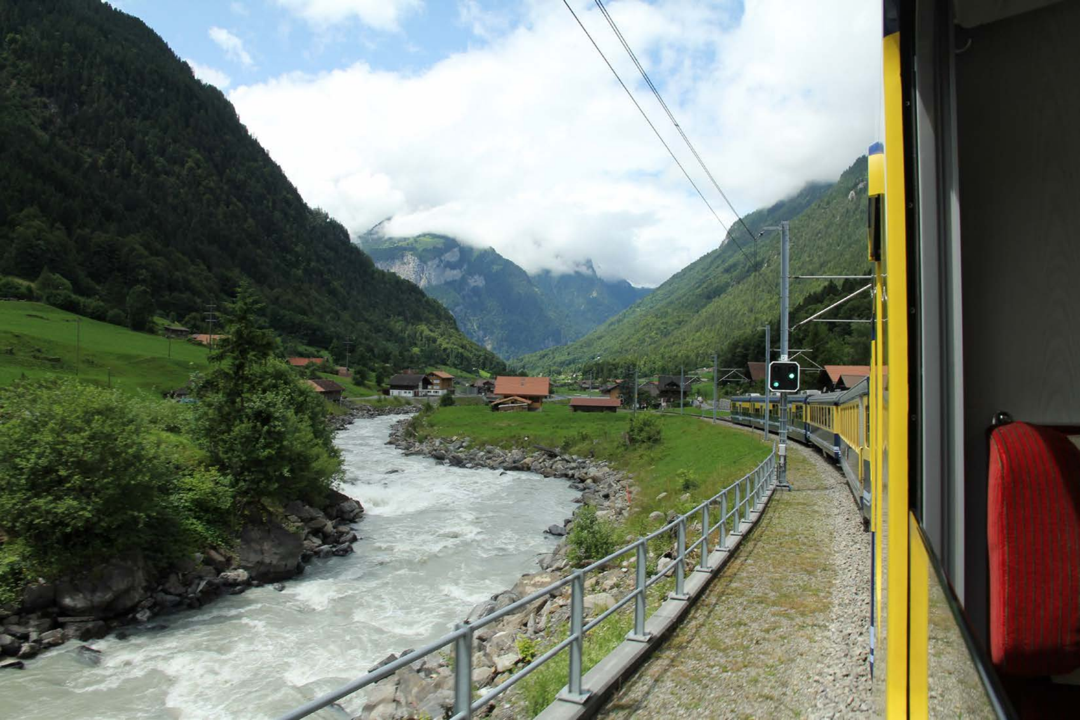
Lauterbrunnen I'm off to the village where I stayed last time.