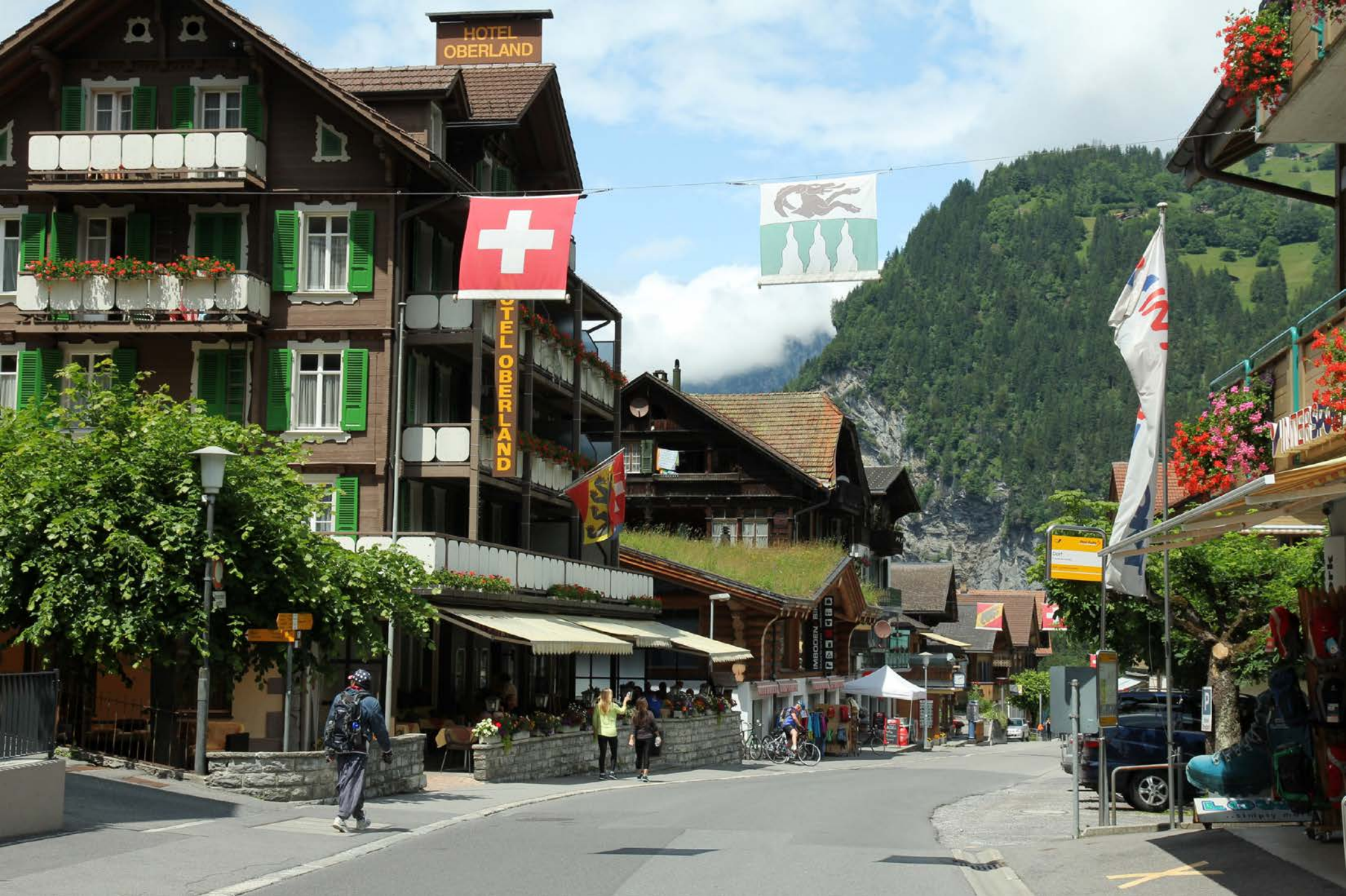
Lauterbrunnen At one time Lauterbrunnen was a mining village, but the building of the railway to the peak of the Jungfrau launched it as a popular tourist destination.