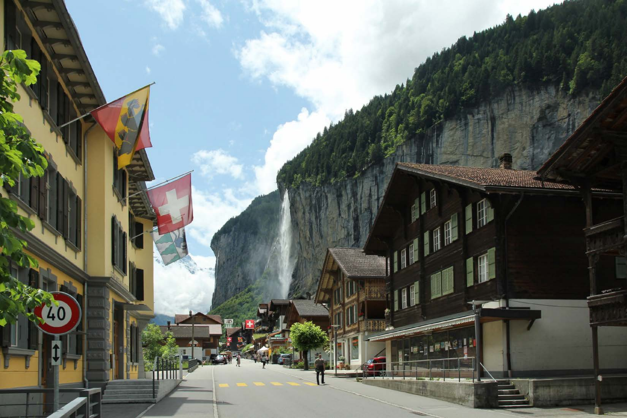
Lauterbrunnen Lauterbrunnen has been settled at least since Roman times because of its strategic location. Population now is about 2,500.