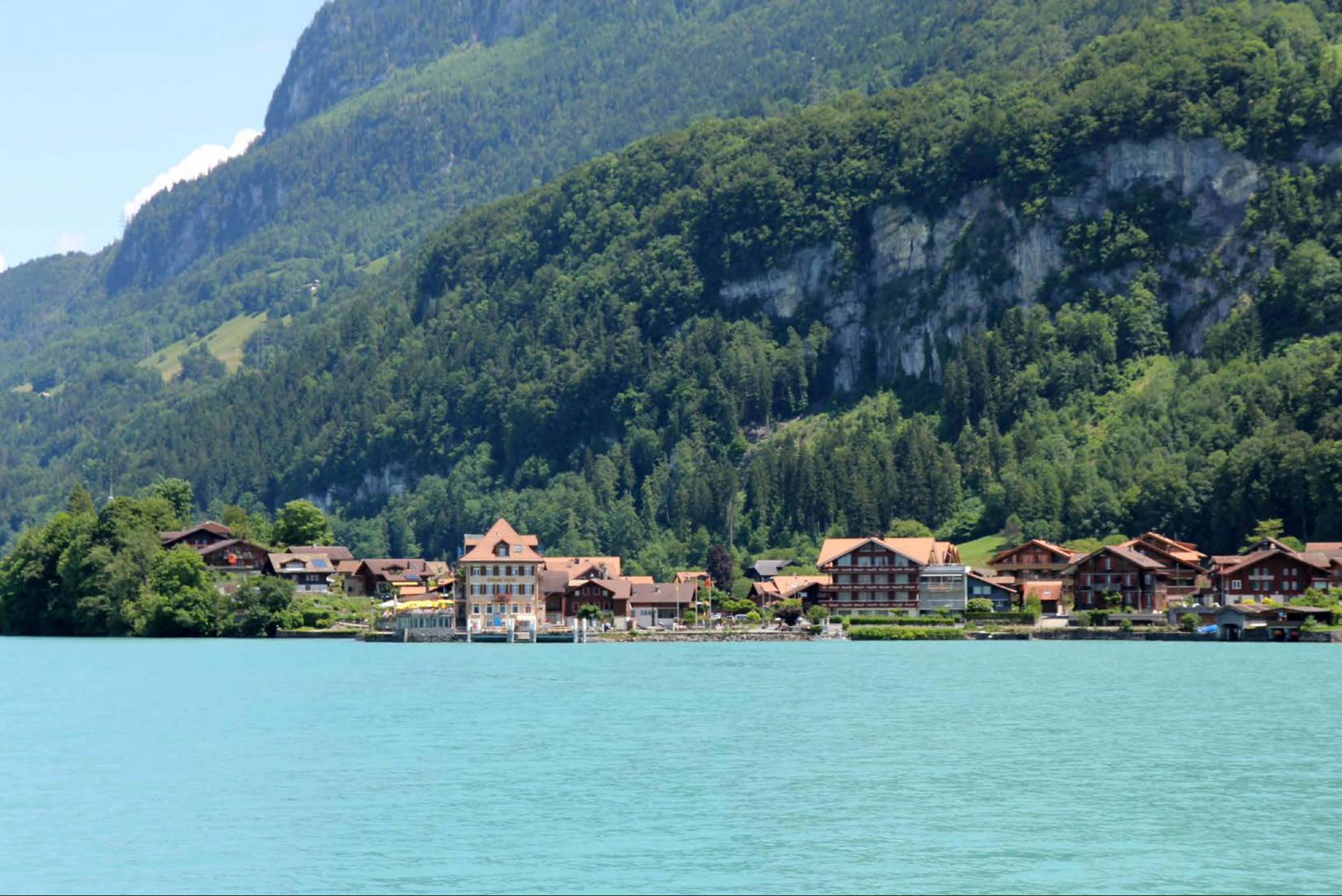
Lake Brienz Approaching Iseltwald