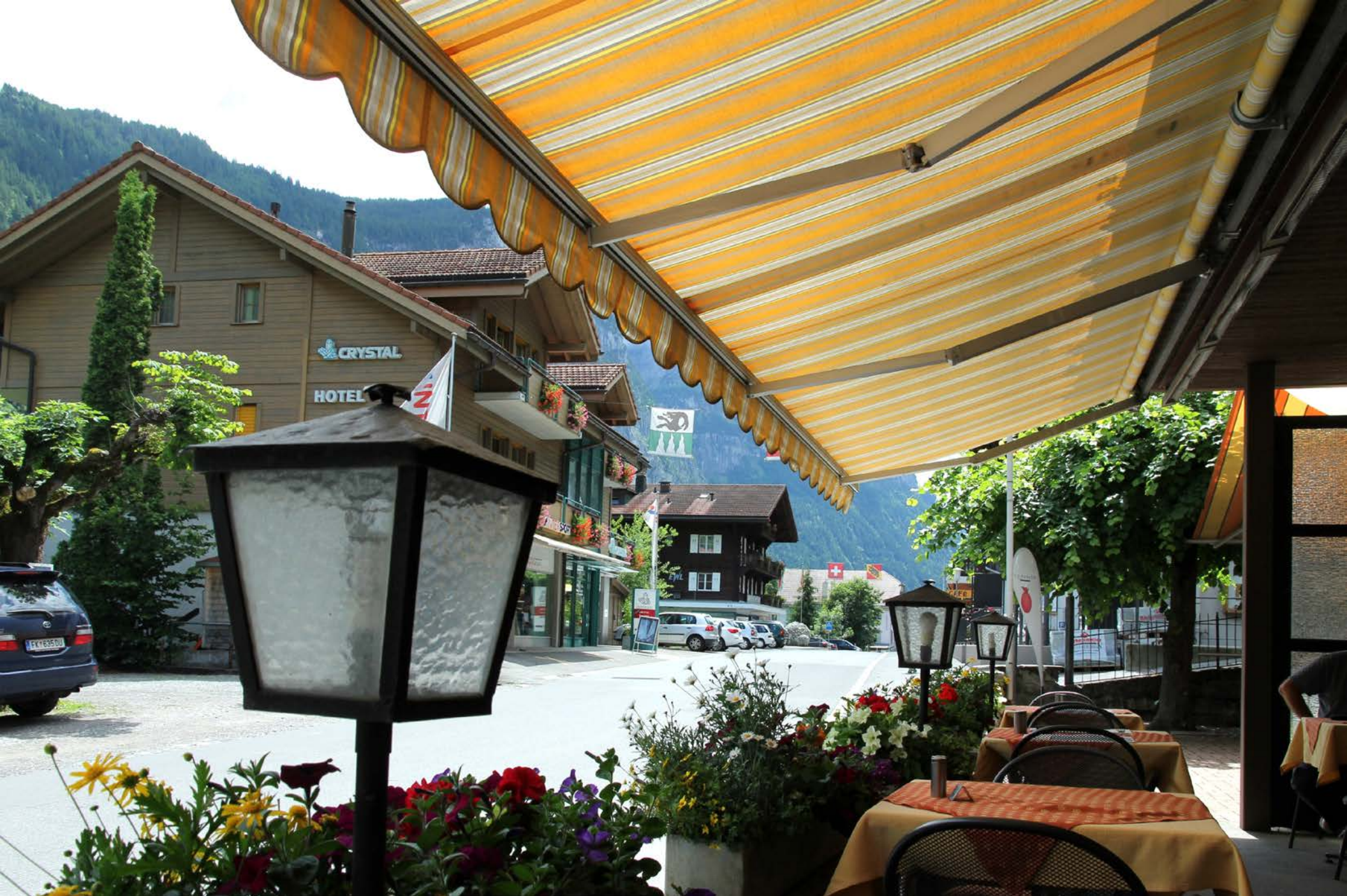
Lauterbrunnen Best lunch in Switzerland at the Hotel Oberland. Prices about half those in Zurich.