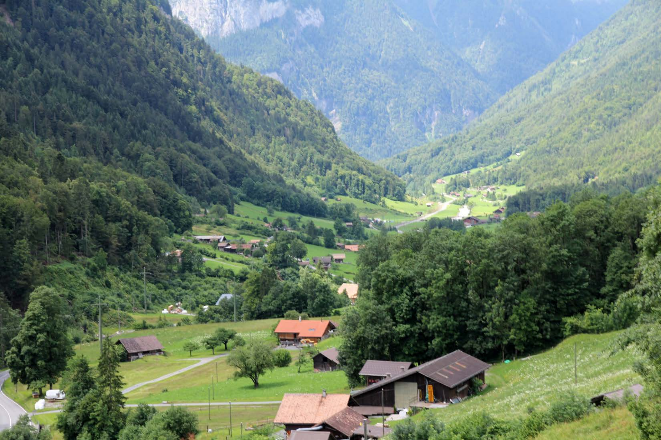
Lauterbrunnen The U-shaped Lauterbrunnen Valley stretches 12 miles / 20 km south from Interlaken into the mountains.