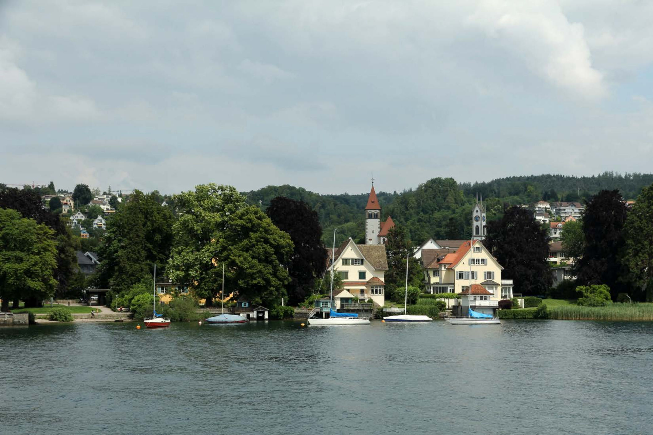
Lake Zurich Zollikon