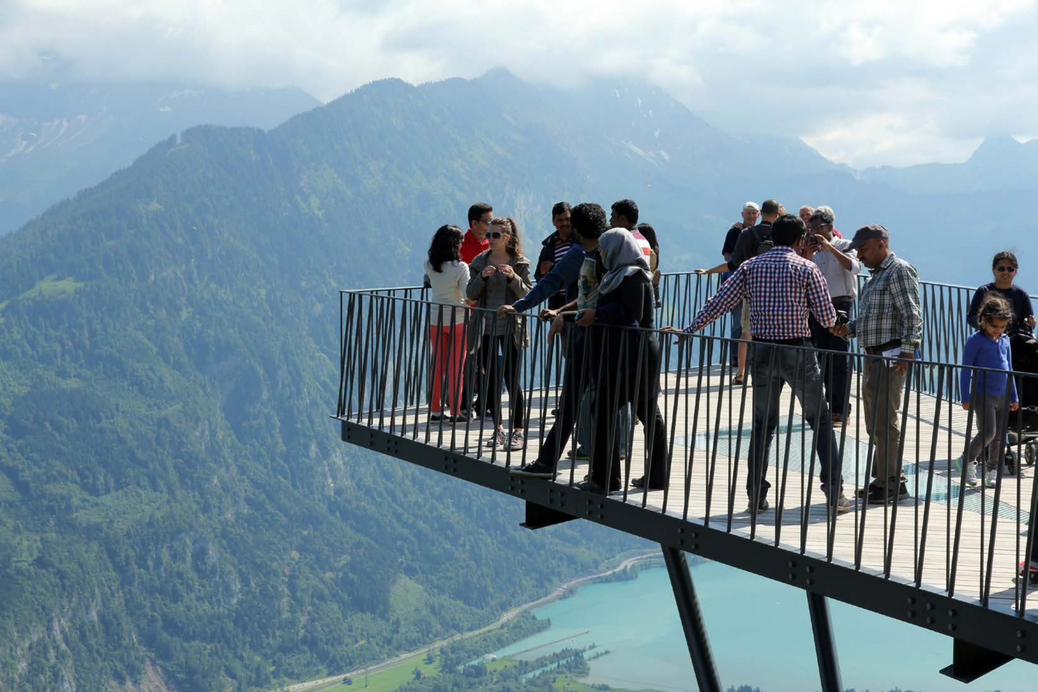
Harder Kulm New viewing platform